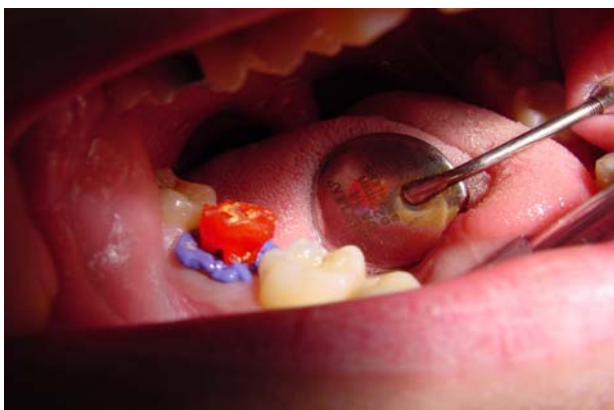
Slika 6. Uzimanje otiska za endokrunu