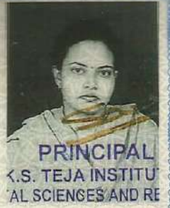
PRINCIPAL K.S. TEJA INSTITUTE OF HEALTH SCIENCES AND RESEARCH